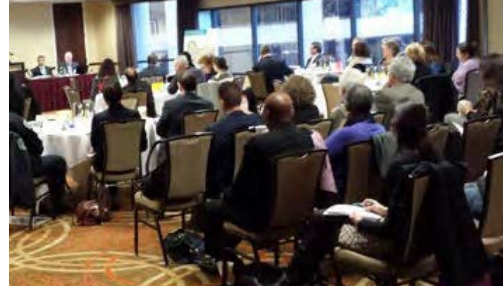
Downtown Stakeholder Working Group, 2013

TxDOT hosts the I-35 Capital Express Central Design Charrette to solicit input from stakeholders regarding previously developed concepts, including a plan to construct another upper deck on top of existing upper decks. More than 30 concepts were proposed over the course of the charrette.